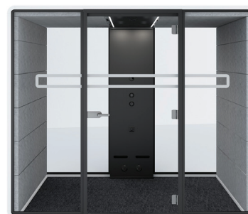
Wheelchair accessible pods available