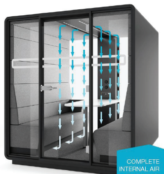
Anti-microbe nanocoating (optional) and efficient ventilation for safety