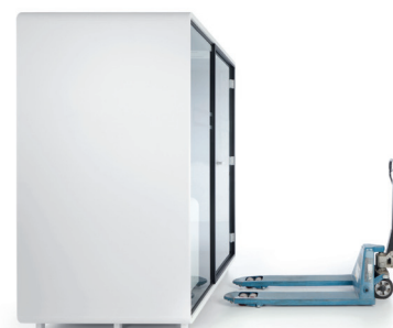
Booths can be easily relocated to meet the changing needs of a clinic.