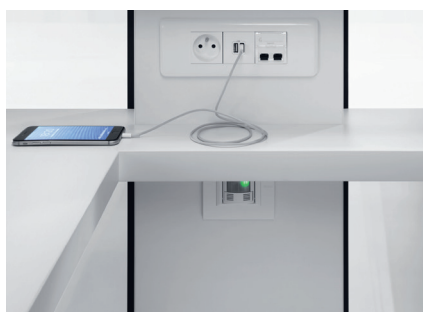
Built-in technology ports: Power, USB-A/C and Ethernet module