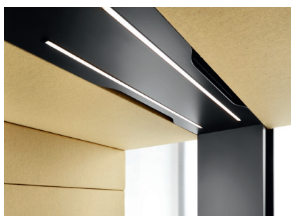
Motion activated, dimmable LED lighting and adjustable airflow for comfort