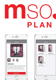
AR iOS app for space pre-visualisation